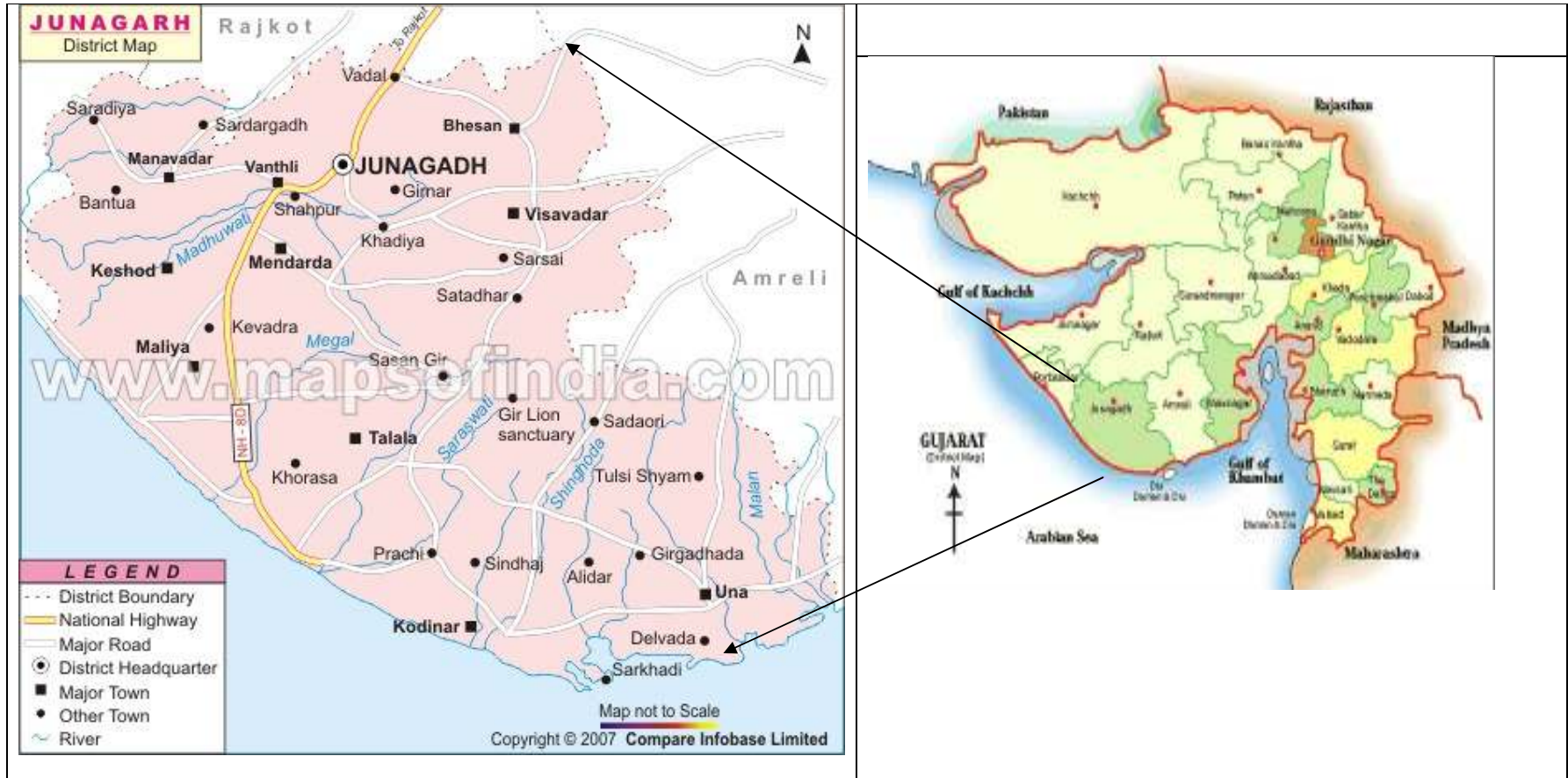
Annexure-1: Location map of Junagadh district